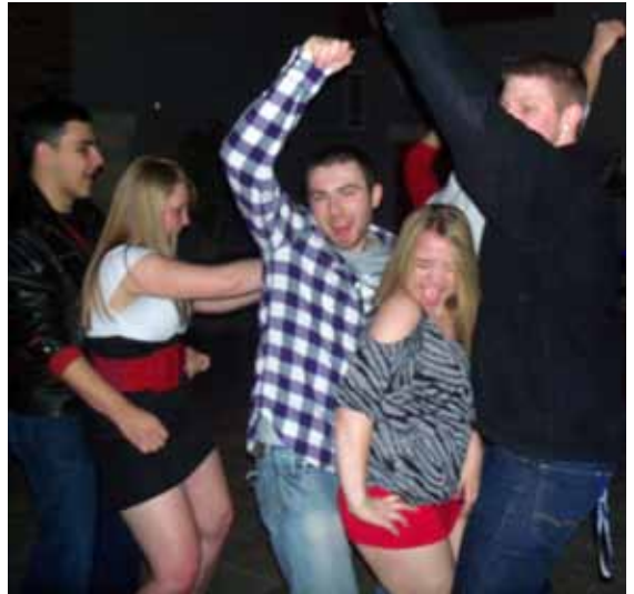
Partying at the Mercyhurst QSA "Flaming Hearts" Dance Feb. 3, 2012