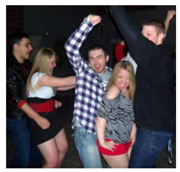
Partying at the Mercyhurst QSA "Flaming Hearts" Dance Feb. 3, 2012