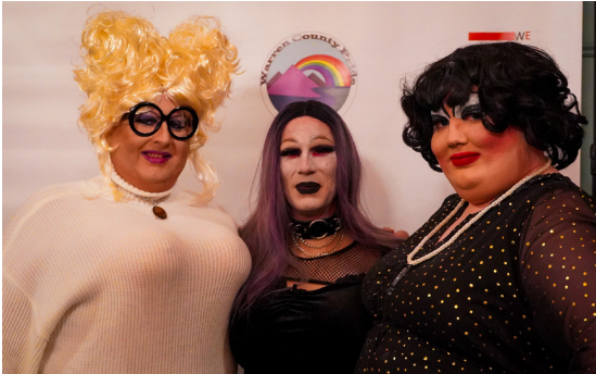
Drag performers at Warren County Pride's PrideDay the 13th at Struthers Library Theatre on March 13.

Serving the Regional LGBTQIA+ Community Since 1992