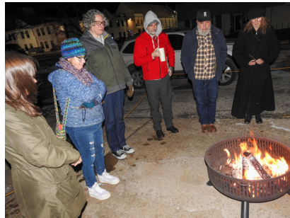
At Journey's Winter Solstice on December 20.

Each office is independently owned and operated.