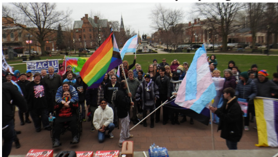
TransFamily of NW PA's March 31 Trans Day of Visibility in Perry Square.

If you would like support or receive more information about resources in the area, reach out to them at their website, transfamilynwpa.org .