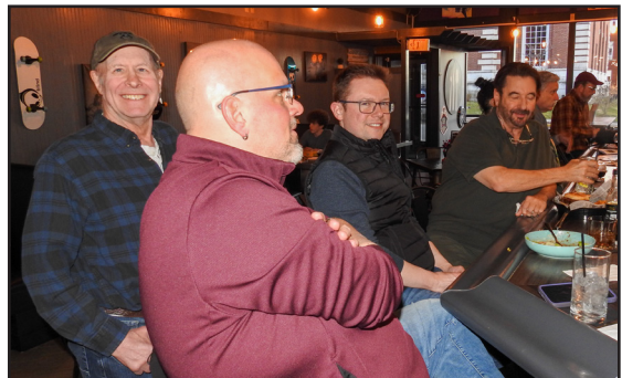
NW PA Pride Alliance held its Meadville Happy Hour on March 26, 2025, at Julian's Bar & Grill, 299 Chestnut Street. Meadville Happy Hours will continue to be held on the 4th Wednesday of each month at Julian's. Erie Queer Happy Hour has returned and will now be rotating through four different establishments.