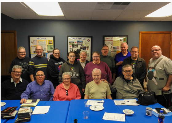
Aging With Pride meeting on April 6 at Lake Erie Counseling, 1932 W 8th St.

My team and I have made it a priority to enact policies that are inclusive of all of our residents, including all who identify as members of the LGBTQIA+ community. One measure of the city's progress and success in this area is the Human Rights