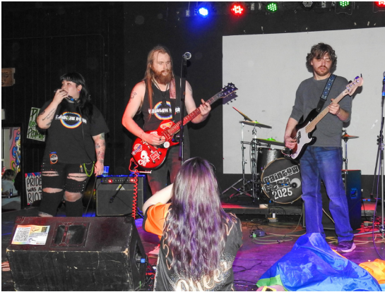
Odd Atrocity performs at Rainbow Fest 2025 on April 5 at Basement Transmissions.

Serving the Regional LGBTQIA+ Community Since 1992