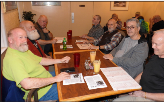
Bears Do Dinner held its 126th meet-up for dinner on April 3 at Tandoori Hut Indian Cuisine. The next Bears Do Dinner will be on May 6.