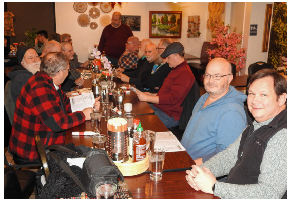
Bears Do Dinner held its January meet-up for dinner at Saigon Nights, 2430 W 8th St, Erie, PA. The next Bears Do Dinner will be on February 4 at Colony Pub & Grille 2670 W 8th St, Erie, PA.