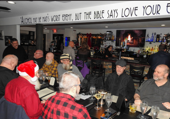
Bears Do Dinner held its December meet-up for dinner at The Boardroom Dining & Spirits, 4353 W Ridge Rd, Erie, PA. The next Bears Do Dinner will be on January 8 at Saigon Nights, 2430 W 8th St, Erie, PA.