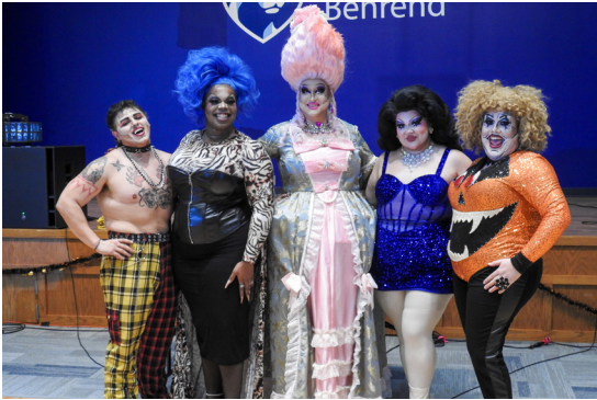
Performers at GASE Behrend Drag Show on Nov 1.

Serving the Regional LGBTQIA+ Community Since 1992