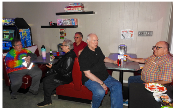
Aging With Pride had a screening of the Merchant Ivory film, Maurice, at Erie Movie House, 3424 W Lake Rd, Erie, PA on October 11.

Nov 7 (Thu) - LGBTQIA+ Recovery Support Group (UPMC Western Behavioral Health at Safe Harbor, 1330 W 26th St, Erie, PA) 5 PM - 6 PM. Our mission