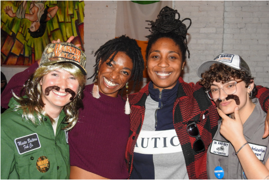
Queering The Vote Rally by Erie Dems Queer Caucus on Oct 17.

Serving the Regional LGBTQIA+ Community Since 1992