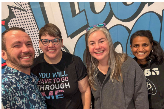
Volunteers at Macy's and Compton's Table Back To School event on August 25.

Serving the Regional LGBTQIA+ Community Since 1992