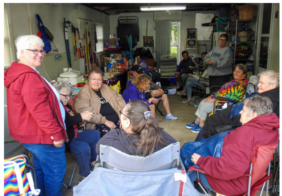
Rainy weather did not dampen the mood at LBT Women Picnic on Sep 7.

Due to the weather, we had to huddle together in the garage, but that didn't stop us from enjoying lots of delicious food, engaging conversations, and laughter. Thank you to everyone who joined us, and we are already looking forward to doing it again next year.