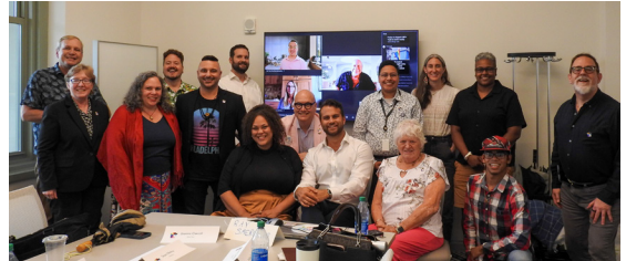
Members of the Governor's Commission on LGBTQ Affairs in the PA State Library in Harrisburg on August 8, 2024.

all commissions to stay up to date with ongoing initiatives! The Governor's Commissions are listed at https://www.pa.gov/en/governor/governor-shapiros-commissions.html , with links to their social media. The six commissions are the Advisory Commission on LGBTQ Affairs, the Advisory Commission on Asian American & Pacific Islander Affairs, The Advisory Commission on Latino Affairs, the Advisory Commission on LGBTQ Affairs, the Advisory Commission on Next Generation Engagement, and the Advisory Commission on Women.