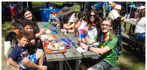
Annual Family Portrait and friends enjoying the potluck picnic at 31st Annual Erie Pride Picnic on August 8 at Rotary Pavilion at Presque Isle.