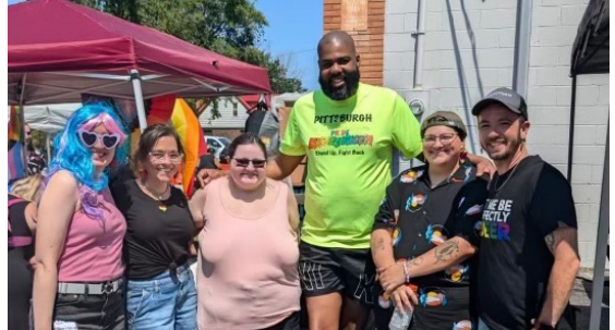
Attendees at Erie Pride 365’s Block Party at 3104 State Street, Erie PA on July 27, 2024.

vendors, food trucks, and an emphasis on voter registration. “Pride in July” showcased local talent and highlighted the importance of community engagement and inclusivity.