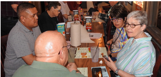
Aging With Pride Dinner at Primanti Bos on June 27.

My hope is that lessons learned from this year will inform the development of future events. This could include contingency plans for outdoor activities that have to quickly pivot to contractual indoor venue spaces with either sponsors or the attendees incurring the costs. Celebrating pride can be joyful but it takes human power, involvement, and in today's society – funding to make it happen. It usually takes rain to make a rainbow, let's shine on.