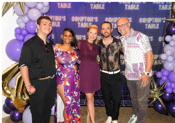
40 Shades of Purple event on June 21 at Erie Art Museum.

Aug 30 (Fri) - Drag Show (M & J's Lounge, 124 Mercer St, Butler, PA 16001) We are a BYOB establishment. Cover charge $6.00. We sell mixers. No outside mixers are permitted.