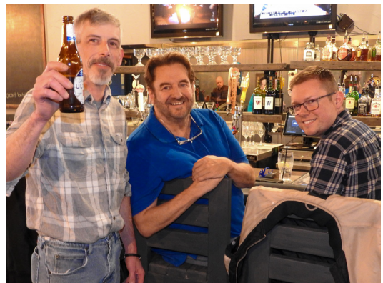
Meadville Happy Hour on April 24 at Julian's Bar and Grill.

Registration is required, whether you are an organization or just want to walk with some of your friends, and can be found at the website above. Step