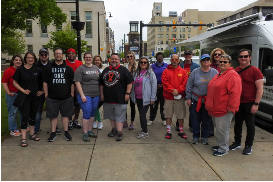
Pictured: Lining up for the 7th Annual HIV Awareness Walk on May 18.

Serving the Regional LGBTQIA+ Community Since 1992