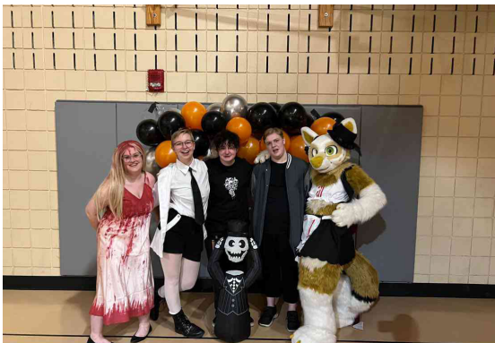
Identity officers at HalloQueen Party 2022