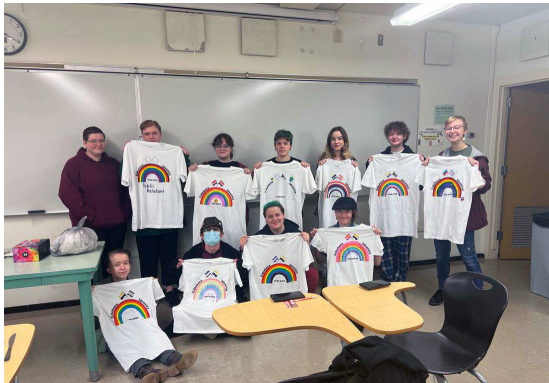
Identity/Edinboro members at their last meeting of the 2022 school year.

Edinboro Identity was founded over 40 years ago as a safe haven for LGBT+ students and their allies. Though it has undergone several name changes, Identity stands proud as one of the oldest clubs on Edinboro's campus. Today, our primary mission has not changed since the club's founding and has expanded to cover LGBT+ history and create a relaxing environment for our members to be who they are. While our education meetings are crucial, we also enjoy the meetings where we watch movies, play games, and generally bond while doing a fun activity. We have a yearly Halloween party, aptly dubbed 'Halloqueen,' for students to dress how they want without societal judgment and gender norms. This past spring, we collaborated with the GASE club of Penn State Behrend and Mercyhurst's SAGA club for a clothing drive, the efforts of which were donated to Compton's Table in Erie. The officers of Identity are considering putting on a drag show open to everyone in the spring as a fun way to bring flair to campus. While Identity is a club reserved for Edinboro students, we are always open to guest speakers who want to present their knowledge to our members. The best way to get in contact with us is through our Instagram, which is @identityboro. There, we post about LGBT+ recognition days and a great way to see what Identity is doing during the school year.