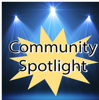
Community Spotlight is a monthly series in which Erie Gay News features a group in our community. Next month: Erie Sisters and Brothers!