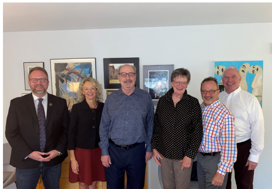
LGBT Endowment Fund board members.

The Foundation signed the Nonprofit Partnership’s Diversity Equity & Inclusion Pledge in 2019 to demonstrate our commitment to our community. To learn more visit www.ErieCommunityFoundation.org .