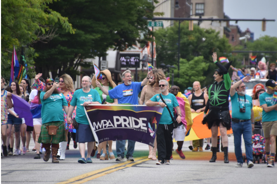
Marching in Erie's Pride Parade on June 24.

Serving the Regional LGBTQIA+ Community Since 1992