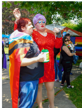
At Warren County Pride on June 17.