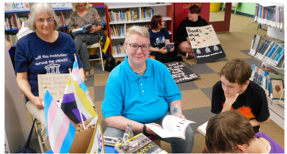
At the Read-in at Blasco Public Library on June 26.