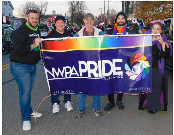
NWPA Pride Alliance board members and supporters in the Meadville Halloween Parade on October 29, 2022.

The ECHTF is a collaboration of local organizations and individuals dedicated to educating, supporting, and advocating for people living with HIV/AIDS along with preventing the spread of HIV. With the COVID-19 pandemic last year, testing and treatment services were limited for HIV and STIs across the nation as well as Erie County. In 2022, significant increases have been reported in HIV / AIDS and STI cases overall. Communicable diseases including HIV/STIs are preventable with education and access to medications, prophylactics, and services. Today medications and programs are available to not only prevent HIV transmission, but allow individuals to live full productive lives. For more information,