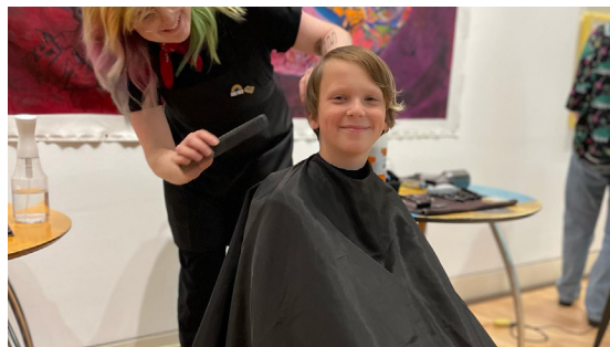
Rocking a fresh haircut for Back To School in True Style.

On Sunday, August 21, Macy's at the Millcreek Mall hosted LGBTQ+ youth for a private shopping