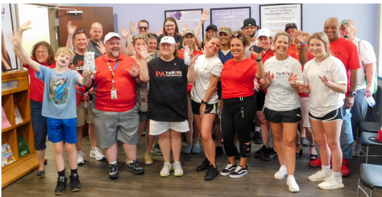
After 5th Annual HIV/AIDS Awareness Walk.

Jul 29 - 31 (Fri - Sun) - Jones Pond Mardi Gras Weekend (100 block party) (Jones Pond Campground & RV Park, 9835 Old State Rd, Angelica, NY 14709-8729)