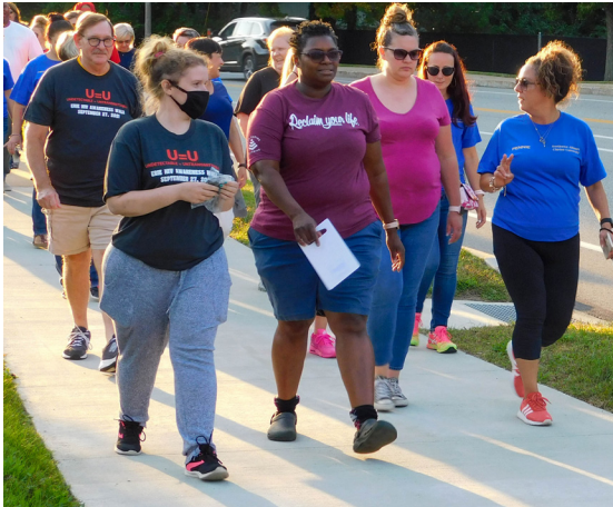
Walking in the 4th Annual HIV / AIDS Awareness Walk on September 27, 2021.