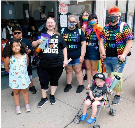
Celebrating Jamestown Pride on June 12.