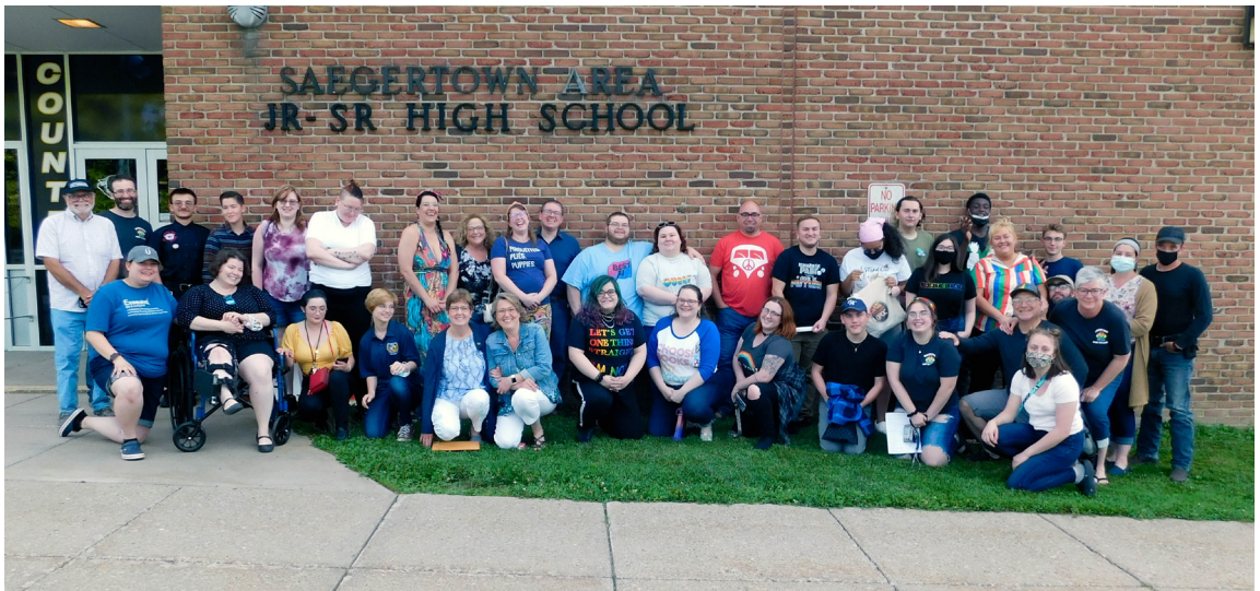
Saegertown Jr/Sr High School students and supporters posed for a group photo after the Penncrest School Board meeting on Monday, June 14.