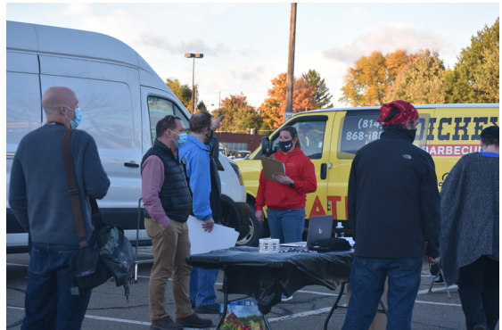
Info tables and participants waiting by the NW PA Rural AIDS Alliance mobile van in the parking lot by Dickey's Barbecue Pit in the Liberty Plaza on October 13.