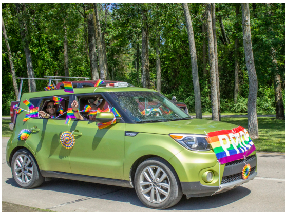
Participants in the Drive Your Pride parade on June 28.