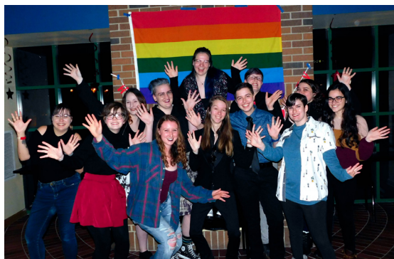
Students from Mercyhurst and Edinboro University proudly display jazz hands at Mercyhurst's Annual Flaming Hearts Dance on February 13, 2020.

https://www.facebook.com/events/236652494018014/