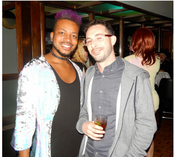
Celebrating New Years Eve 2020 at The Zone.

Domestic Violence can affect individuals of every age, race, gender, and sexual orientation.