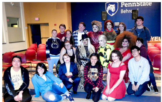
Drag performers with GASE members at Behrend's 13th Annual Drag Show.

If your business or organization would like an