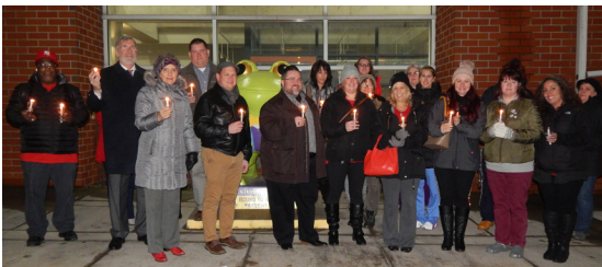
Members and supporters of Erie County HIV Task Force held a World AIDS Day event with candlelight vigil on Dec 2 at Blaso Public Library.

The Erie Regional GSA (a partnership between GEAE and Blasco Library) hosted a Friendsgiving for the LGBTQ youth to celebrate and give a safe space to young people while enjoying a holiday meal. Twelve young people attended, enjoyed food, brought desserts, and met new friends, that was hosted by the Erie Day School. Meetings for the GSA will continue throughout the winter with the addition of movie nights and some other special events. Check out the calendar for all updates: http://greatereriealliance.com/gsa-program/