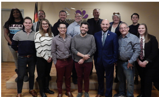
PA Commission on LGBTQ Affairs meeting at Bradley-Sullivan LGBT Community Center in Allentown PA