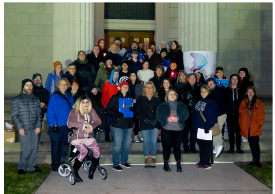
Participants at the Transgender Day of Remembrance Candlelight Vigil, held Nov 20 on the steps of the Erie County Courthouse, 140 W 6th St, Erie PA.