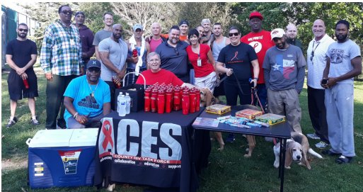
Participants at 3rd Annual HIV Awareness Walk on Sep 16 in Frontier Park.

A logo was selected for the City of Erie's LG-