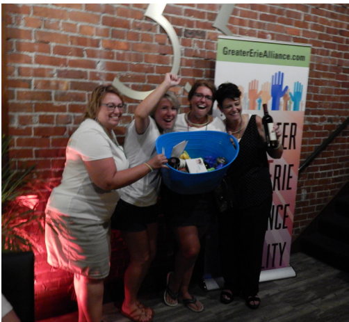
Raffle winners at GEAE's Speakeasy Singalong on August 21 at Room 33.