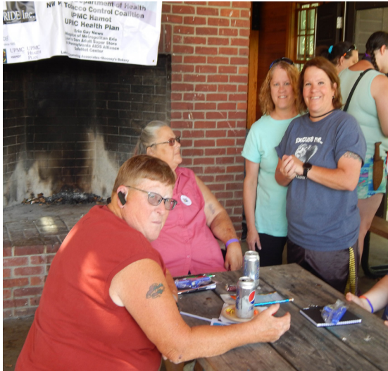
Friends having a great time talking at NW PA Pride Alliance's Erie Pride Picnic on Aug. 10.