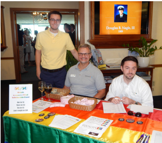
Greater Erie Alliance for Equality (GEAE) board members greet attendees at the 9th Annual Afternoon for Equality at the Erie Yacht Club on July 14.

Greater Erie Alliance for Equality (GEAE) hosted a Welcome Reception on Friday, August 9 for the Pennsylvania Commission on LGBTQ Affairs, which held their quarterly meeting in Erie that day, as well as for the Mayor's LGBTQ Advisory Council. The event was also open to the greater community. There were appetizers and a cash bar, as well as a great chance for advocates from across the state to meet local community members.