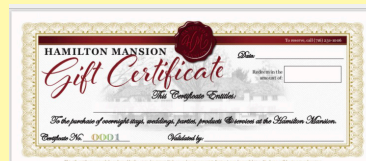
Gift certificates available