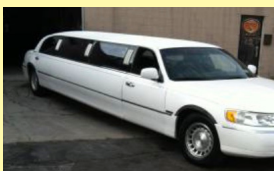
Private Limo Wine tours

9 Guest Rooms Available We Host For Any Occasion -Holidays, Weddings and Parties -