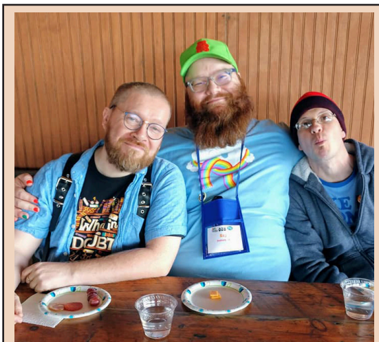
Sipping and schmoozing at the Drenched Fur 15 winery tour.