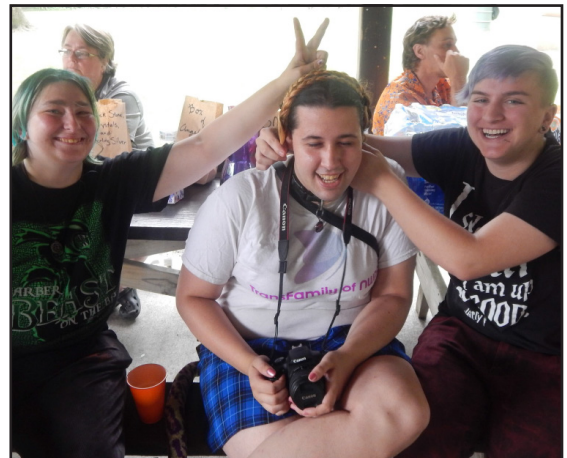
Fun at the TransFamily picnic this past summer. Check out TransFamily on this page. .