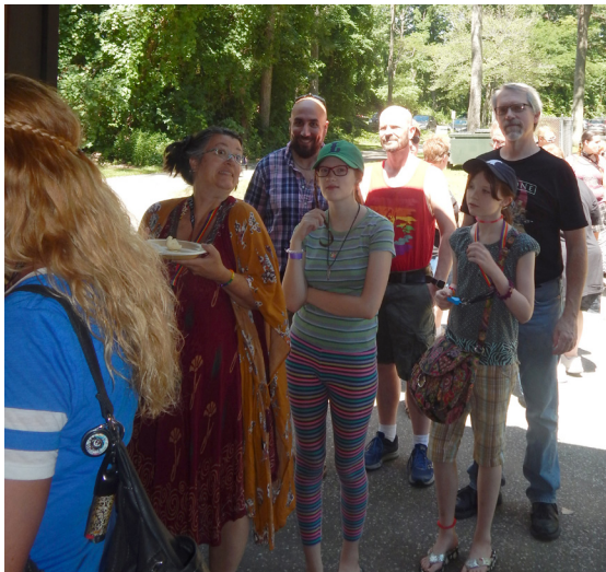
CHOW TIME! Attendees at the NWPA Pride Alliance Picnic lining up for some good eating!