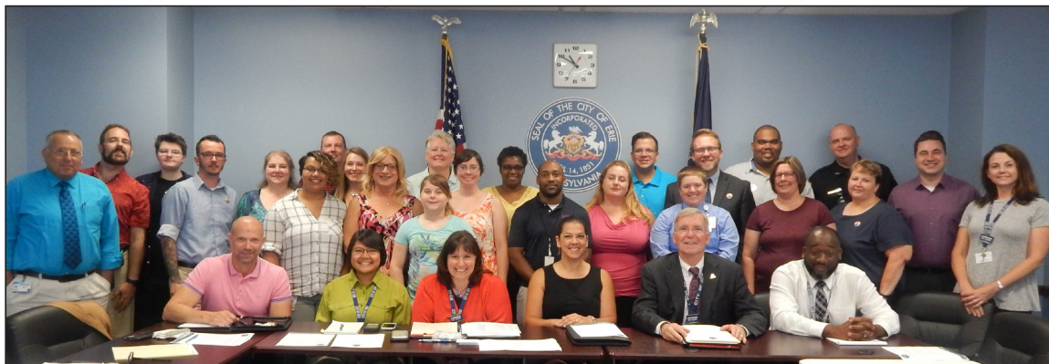
MAYOR'S LGBTQ+ ADVISORY COUNCIL First-ever Mayor's LGBTQ+ Advisory Council (pictured here) started meeting in City Hall on July 17, 2018. For more on that, see page 6