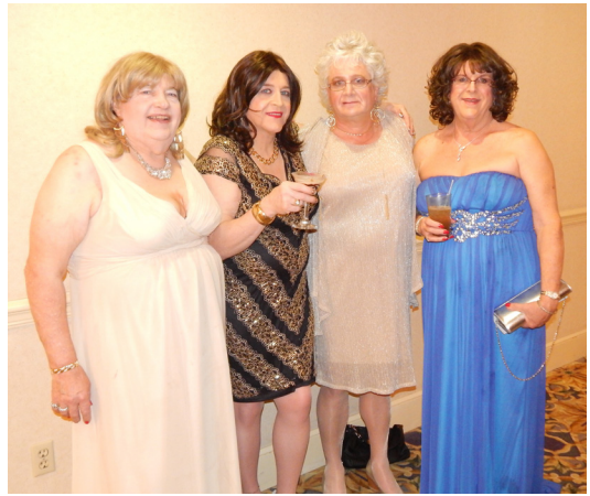
Attendees at Lake Erie Gala's traditional Saturday evening Glitter Ball. The Gala is hosted by Erie Sisters and Brothers. Photo gallery at www.eriegaynews.com