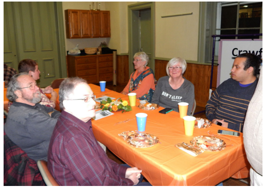
CRAWFORD AREA LGBT+ THANKSGIVING The Crawford Area LGBT+ group held a Thanksgiving potluck with members and supporters on Nov 14 at the Unitarian Universalist Church of Meadville.