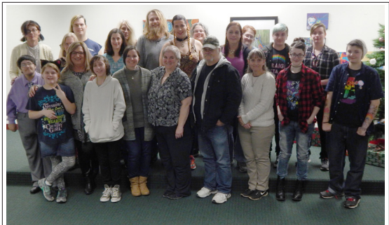
TRANSGIVING 2017 A couple dozen attendees enjoyed a Thanksgiving dinner hosted by TransFamily of NWPA. The dinner was held November 18 at MHA of NWPA.