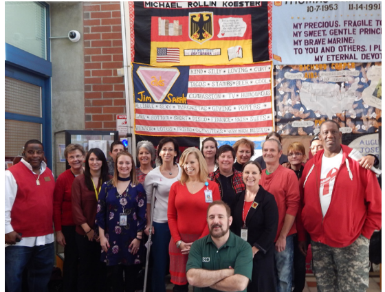
AIDS QUILT PANELS Members of Erie County HIV Task Force and friends by AIDS Quilt panel display at Erie County Blasco Memorial Public Library

On Sunday, November 19, 2017, TransFamily of NW PA held a Transgender Day of Remembrance Candlelight Vigil on the steps of the Erie County Courthouse, 140 W 6th St, Erie PA. The event was attended by transgender people, as well as their families, friends and supporters. Local TV covered the event. This was the fifth year that there had been a local observance of Transgender Day of Remembrance.