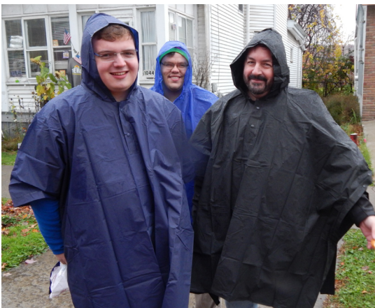
Dressed for the weather! Folks from the Crawford Area LGBT+ contingent in the Meadville Halloween Parade..