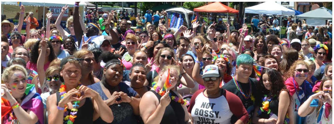
RECORD ATTENDANCE AT PRIDEFEST Organizers at Erie Pride Fest estimate attendance at 750, making it the largest local Pride event to date. Recap article on page 4, photo gallery at both NW PA Pride and Erie Gay News sites.