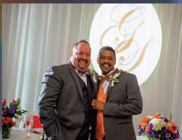
Wedding Photos by: Eric Smyklo