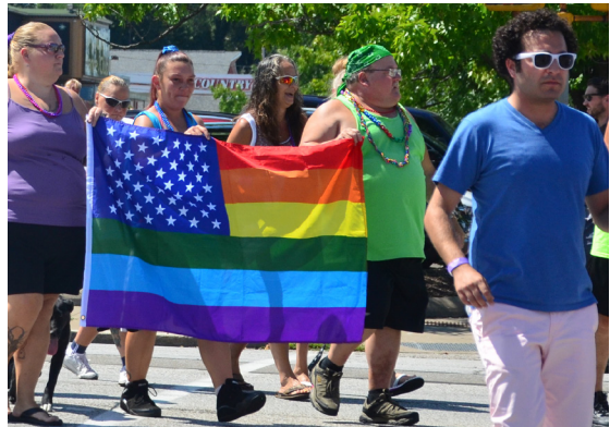
PRIDE MARCH 2016: Stepping off at the March to Erie Pridefest on Aug. 27. Recap on page 4.

This project is made possible by a grant from the Erie Community Foundation. Additional funding was provided by the Community Health Network, Corry Memorial Hospital, LECOM Millcreek Community Hospital, St. Vincent Hospital, UPMC Hamot, and the United Way of Erie County.