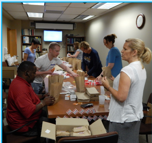
ERIE CO. HIV TASK FORCE WORK PARTY: On Friday, July 22, 2016, members of the Erie County HIV Task Force gathered to prepare packets of safer sex supplies and info to be distributed at various locations around the county. Facebook: eriecountyhivtaskforce Twitter at @ErieCountyHIVTF

Sep 11 (Sun) - LBT Women meets (Brew Ha Ha at the Colony, 2612 W 8th St, Erie, PA) 12 PM. Contact: