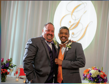
Wedding Photos by: Eric Smyklo