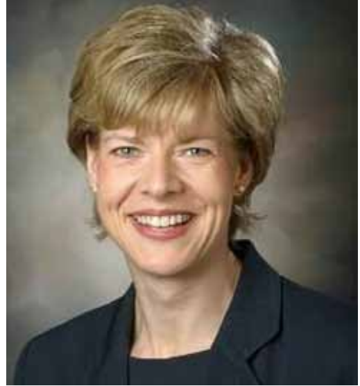
November 6, 2012, Tammy Baldwin (D-Wisconsin) became the first openly gay candidate to be elected to the U.S. Senate. See item on elections on this page.