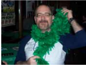
In a somewhat candid/campy moment.

Speaking of the Zone, if you can, please come to the Drag Show there on May 9 to benefit the Leukemia and Lymphoma Society. Not only is this a fundraiser for a very worthy cause, but Sharon Needles (one of the final 3 queens on RuPaul's Drag Race) and her partner