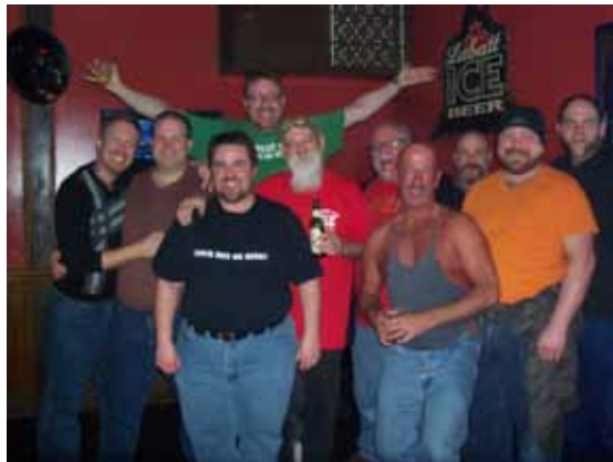
Some friends at a recent Bear Bar Night. Join us at the next on May 18 at the Zone!