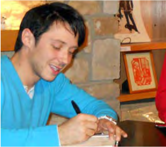
Johnny Weir, autographing his book.

U.S. figure skating champion Johnny Weir was doing a book signing at the Erie Book Store January 16. Some of the folks at the Pride planning meeting headed over after the meeting for autographs and browsing (see below). Weir's book—a memoir—is entitled "Welcome to My World."