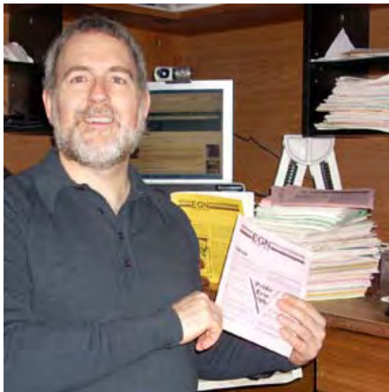
How I spent my winter vacation.

You can see an index of all of the back issues by year at http://www.eriegaynews.com/printedition/backissues.php . For area history that goes back as far as the late 1960's, check out http://www.eriegaynews.com/history . (And any additions/corrections to this are VERY much appreciated!