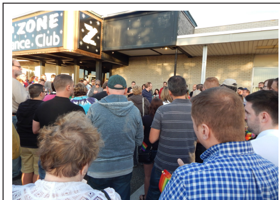
VIGIL FOR ORLANDO VICTIMS: About 120 people came together on June 12 at the Zone to remember the victims of the Pulse mass shooting. More on page 4-5.

If you are vending, please provide the additional information: