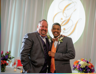
Wedding Photos by: Eric Smyklo