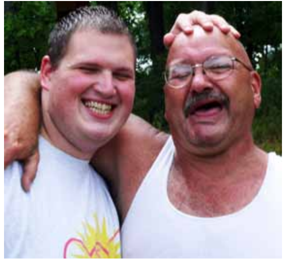
Attendees at last year's Butler PFLAG picnic. Check it out this year July 14 in Alameda Park, Butler. Details in our calendar, photos of last year's picnic at www.eriegaynews.com

In the last six years, I've tried reaching out to