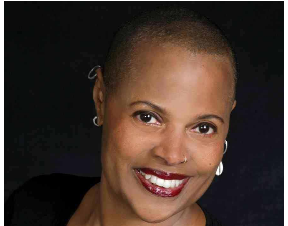
Sapphire—performance poet and author of Push (inspiration for the movie Precious) will speak at Behrend April 4.