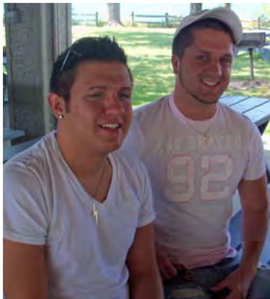
A couple of the folks who attended Ashtabula picnic on July 17.