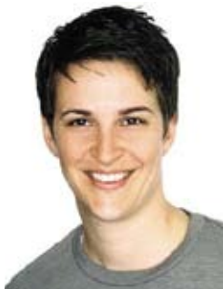
Rachel Maddow is one of the 31 icons profiled

Each day in October 2009, an Icon is featured with a video, biography, bibliography, downloadable images and other educational resources. The resources for GLBT History Month 2009 Icons will be available in October at www.glbthistorymonth.com . The 93 Icons with resources for