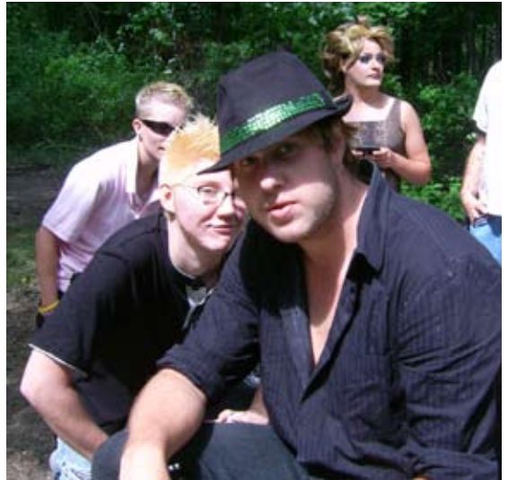
At the Ashtabula Family Picnic on August 15. More photos from the picnic online at www.eriegaynews.com

Oct 10 - Leave late morning for Washington, D.C. for