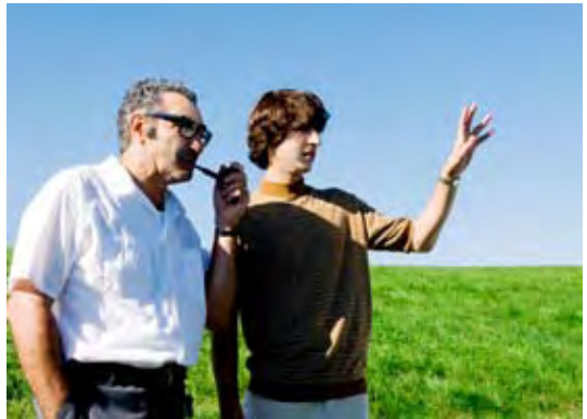
Demetri Martin plays Elliot Tiber and Eugene Levy is farmer Max Yasgur in Taking Woodstock.