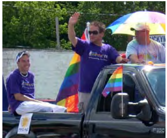
Members of Erie Gay Pride wave to crowd at the July 4 Mill-creek Parade.

For five years now, the Drenched Fur Committee has been hosting the Erie's Bear Run in the late winter/early spring. And in response to requests for an outdoor/summertime event, the DF Committee has planned an outing to Waldameer and Water World on Saturday August 22nd. For just $17, you will get a combo pass for all the rides and slides to enjoy along with the other bears, cubs and admirers. We're inviting folks to join us for a BYOL (Bring Your Own Lunch) between 11am and 1pm. After lunch, we'll head into the water park for a few fun soaked hours and then enjoy for dinner the various food rides the amusement park offers. Then it's on to midway games and rides