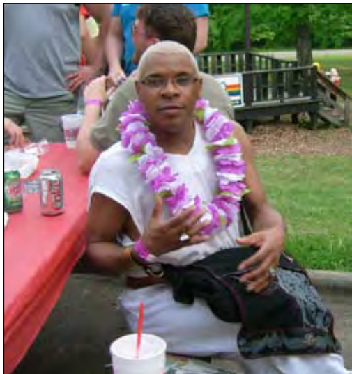
Ballroom dancer at The Pittsburgh Memorial Day Picnic. See more photos from Pittsburgh's Memorial Day Picnic online at www.eriegaynews.com