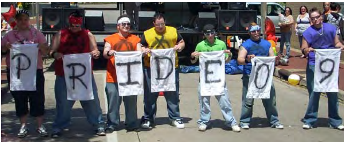
Performers at first Youngstown Pride celebration on June 6. More photos of Youngstown Pride available at www.erie-gaynews.com

Stay updated on the subject at www.dowhatsrightohio.com The project is a collaboration between Progress Ohio, Equality Ohio, and other pro-equality organizations.