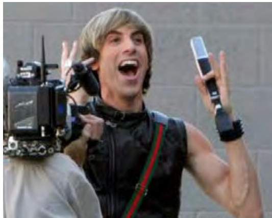
Bruno (Sacha Baron Cohn) opens in theatres July 10.

Margaret Cho's new concert film Beautiful will premiere on Showtime July 3 at 11 PM. www.margaretcho.com/